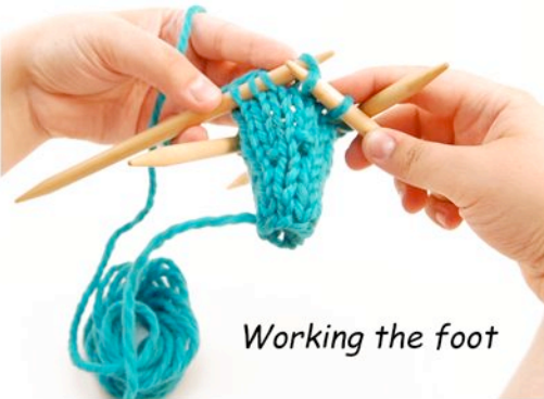
Working the foot