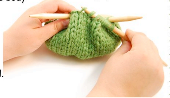
Picking up sts for base

Cut yarn and thread through the remaining sts.