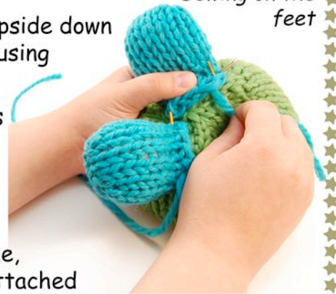
Sewing on the feet

Now, grab your felt and cut a small rectangle, using the face as a gauge for width. Take your scissors and cut up and down to create little teeth. Position the teeth on the face where you want them to go and using your fabric glue, glue the teeth down. Use some books and stack them on your Chunk's face to secure the teeth until the glue dries. Cruel I know, but trust me, your Chunk will thank you for it when his teeth stay securely attached to his face. That's it! Now go make a few more Chunks and host a monster dance party!