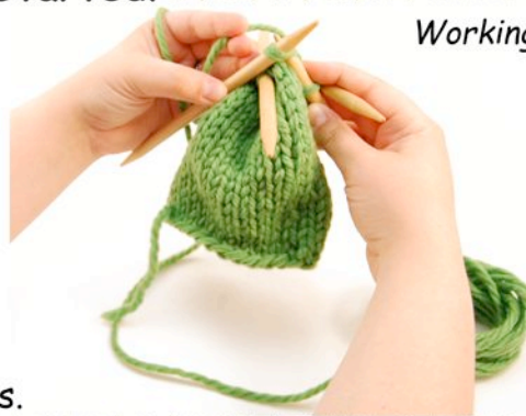
Working the body

Cut yarn and thread through the remaining sts.